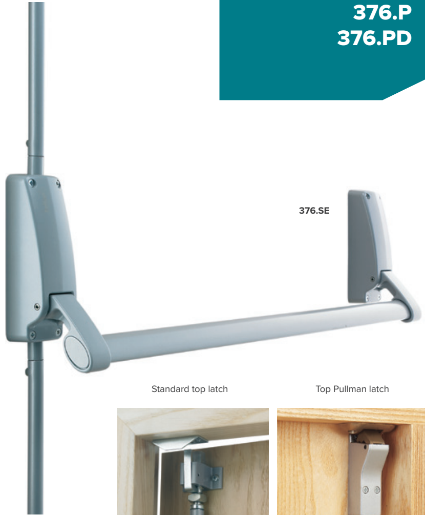
Standard top latch