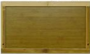
Bottom Panel x 1