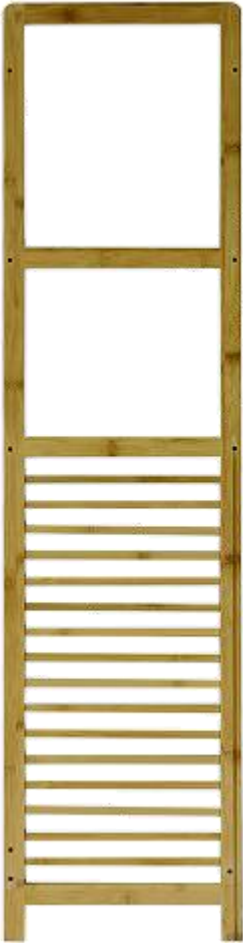
Side Stand A x 1