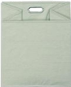
Storage Bag x 1