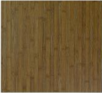
Back Board x 1