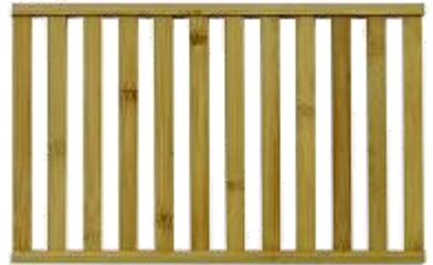
Slatted Board x 3