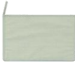
Bottom of Storage Bag x 1