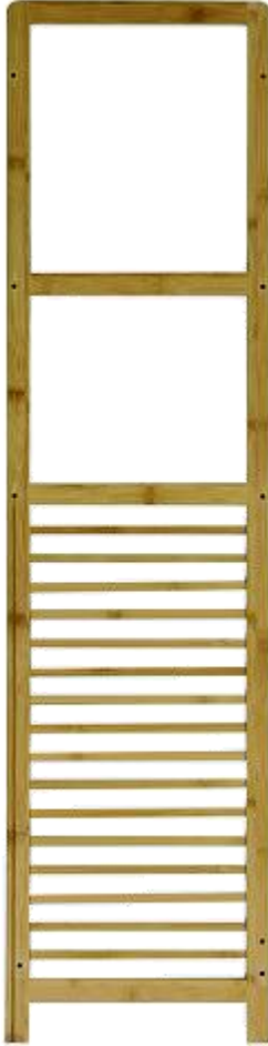
Side Stand B x 1