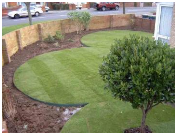
Can be bent to form curves and shapes