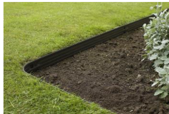
Can be bent to form angled corners

Swift Edge strips are flexible and can be bent easily by hand to form angled corners, curves and shapes. Each strip fastens firmly to the ground with barbed stakes provided in each pack driven through slots on the reverse side. Maintenance free and available in a choice four attractive colours and five pack sizes, Swift Edge garden edging will help you keep your garden edges looking neat and well-presented for many years.