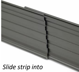
Slide strip into slots to connect

The aluminium strips of Swift Edge are light and easy to handle. They connect by sliding one piece into the slots at the back of another – this allows you to edge an area without cutting the strips. Alternatively, use the joining pieces provided with each pack to create a flush face to the edging.