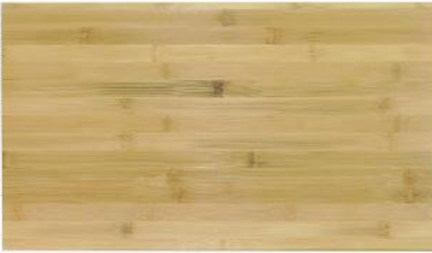
Board x 1