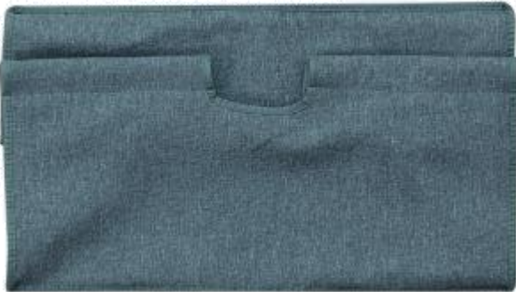
Cloth Bag x 4