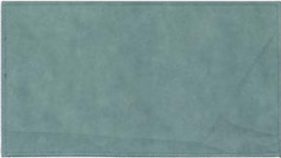
Bottom Sheet x 4