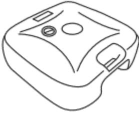
A: Umbrella Base (x1)