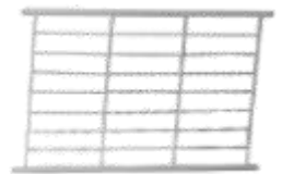
I: Wire Mesh (x1)