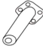
B: Leg (x4)