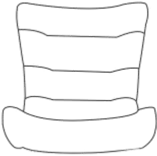
A: Seat (x1)