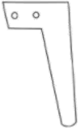
D: Leg (x4)