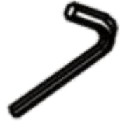
C: Allen Wrench (x1)