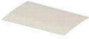
①: Board (x2)