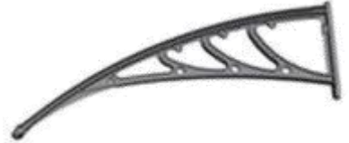
③: Bracket (x3)