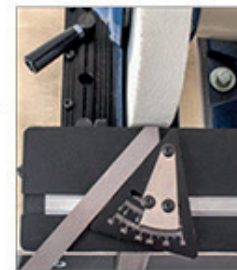
SHARPEN TOOLS AT EXACT ANGLES