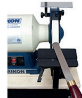
USE PRO SHARPENING SYSTEM'S PLATFORM TO SHARPEN A VARIETY OF BLADES