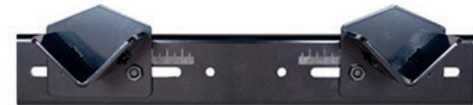
TOOL HOLDERS ADJUST FOR SETTING PROPER SKEW ANGLES

holds woodturning gouges for sharpening bevels at consistent, repeatable angles and shape with your bench grinder and the PRO Sharpening System. Adjusts 40°, so setting bevels to grind on your tools is easy. Jig's clamp firmly holds tool shafts 3/16" to 1-3/8" thick and up to 1-9/16" wide. Ideal for sharpening spindle and bowl gouges, roughing gouges, and for maintaining their cutting edges – from simple bevels, to side ground variations, to the traditional fingernail shape. Works for sharpening carving tools, too!