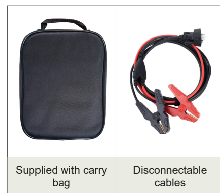
Supplied with carry bag