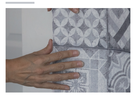
Press the wallpaper down firmly, smoothing out to the sides in order to push out any trapped air. Ensure the edges and the corners are firmly stuck down.