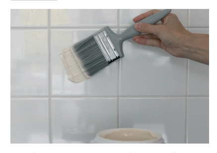
Apply a coat of special 3D wallpaper glue (270-1098) directly to the wall if the surface is non-absorbent (eg ceramic tiles)