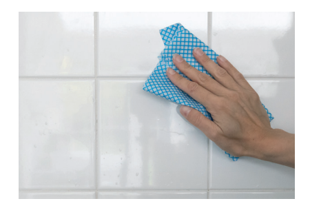
Only apply to a solid, flat, clean, dry surface (flat walls and flat tiles are ideal).