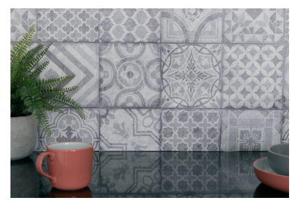
That's it! Stand back and admire your new look kitchen or bathroom!