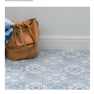
Allow 24 hours for the adhesive to bond