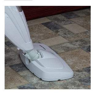
Vacuum cleaners are fine to use too! Caution - Take care with sharp objects!