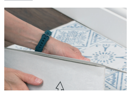
Snap the tile back to remove the cut piece