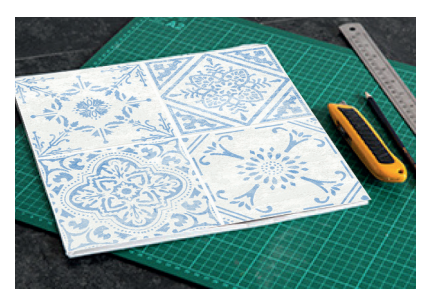
Tools for the job !