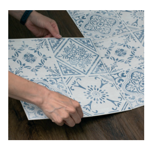
Butt join the tiles and stick to the floor