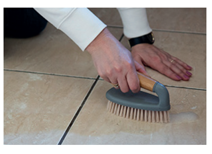
Clean surface to remove any dirt and dust.