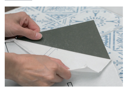
Peel away the backing paper