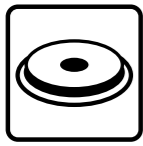
ELECTRIC/ SOLID HOB

Refer to the symbols displayed below to ensure suitability for your hob: