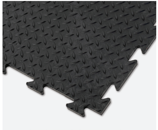
Black only. Bevels available in both black and yellow