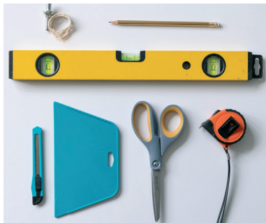
Tools for the job.