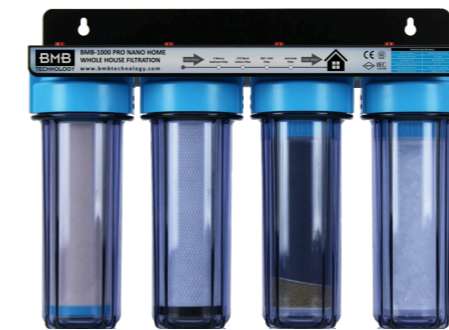
Figure 5: BMB-1000 Pro Nano Home