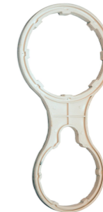
Figure 4: Housing Wrench