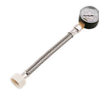
Figure 1 - Water Pressure Gauge.

Please ensure the incoming water pressure is tested before taking out the installation. This can be performed by using a Pressure Gauge (Figure 1). This can be purchased online or at your local plumbing stores. Otherwise, you may want to ask your plumber to test the water pressure for you.