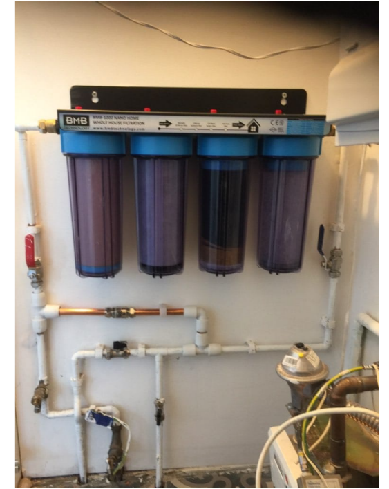
Figure 2: BMB-1000 Pro Nano - Bypass Setup

Depending on the location and current pipework, you may need extra equipment such as extra copper pipes, hoses, pipe cutters etc.