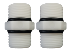
Figure 3: 2 x 3/4" NPT – 3/4" BSP Nipple