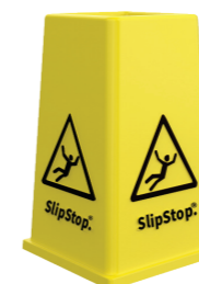
SlipStop® Cone The SlipStop Cone can also be stacked for efficient storage. Size: 550 x 550 x 900 mm