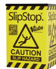
SlipStop® 65 SlipStop 65 can be flat packed for convenient storage. Size: 450 x 450 x 650 mm