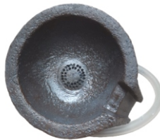
B. Top of Fountain (1x)