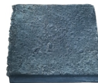
C. Back Cover (1x)