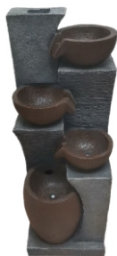
A. Body of Fountain (1x)