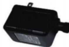
E. Adapter (1x)