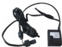
D. Submersible Pump (1x)