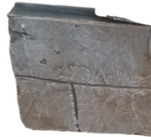
B. Back Cover (1x)