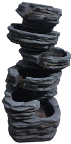
A. Body of Fountain (1x)