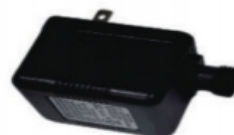
D. Adapter (1x)