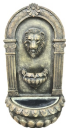
A. Body of Fountain (1x)