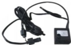
C. Submersible Pump (1x)