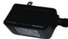
D. Adapter (1x)