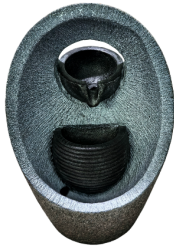
A. Body of Fountain (1x)