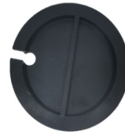
B. Back Cover (1x)