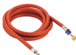
EXTERNAL HOOK UP ON A LEISURE VEHICLE