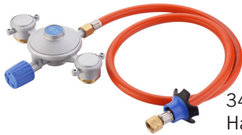
346-10-UK Handwheel Tightening

Innovation from CADAC; the Dual Power Pak operates two threaded cartridges simultaneously, continuously regulating to 28 mBar. This therefore results in approx. 8 hours worth of gas when used on full power. With the gas being regulated simultaneously from both cartridges, this does not mean that one cartridge empties before the other, both are drained at the same time.