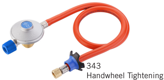
343 Handwheel Tightening

The EN417 Regulator is used most often with the Safari Chef 30 LP and 2 Cook 2 Pro Deluxe barbecues, two of our smallest appliances. The regulator itself simply screws into the top of the cartridge and the hose then goes to the barbecue itself, using either the handwheel tightening (343) or the Quick Release fitting (343-QR).