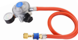
8516-FL-QR LP PROPANE CLIP-ON REGULATOR QR

Inlet size 27mm. Suitable for Calor Patio 5kg, Flo 6kg, Gaslight 5/10kg.