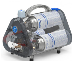
TRIO POWER PAK