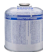
THREADED CARTRIDGE 500G *Safari Chef 30 HP