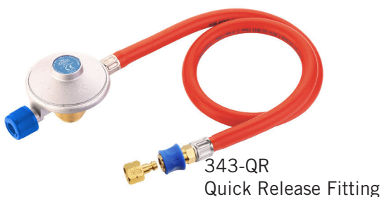
343-QR Quick Release Fitting