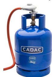
REFILLABLE GAS CYLINDERS