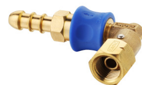
338-2 90 Degree Rotating Quick Release