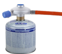
THREADED CARTRIDGE REGULATOR