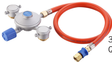
346-10-QR-UK Quick Release Fitting