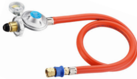
8518-FL-QR LP PROPANE SCREW-ON POL REGULATOR QR