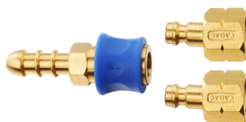
338-1 2 Nut Quick Release