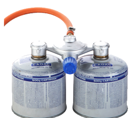
DUAL POWER PAK