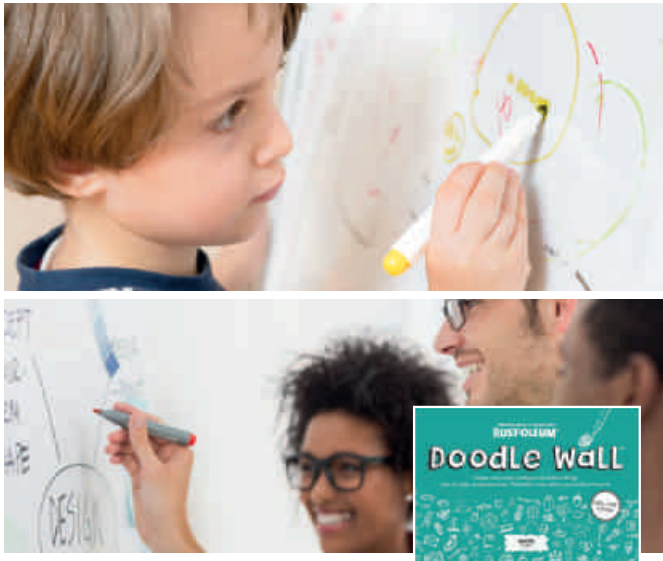
*Only available in selected B&Q stores and online at www.diy.com

A smooth, hard finish that creates a unique, clear or white, writeableerasable surface. Once dry, simply use dry wipe markers to draw or write messages and then erase. Application is easy and it has minimal odour making it safe to use indoors. Ideal for use on painted interior surfaces such as: plasterboard, hardboard, wood, cement and metal.