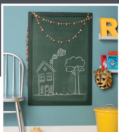
Old School Green