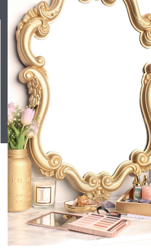
Super Sparkly Glitter - Gold