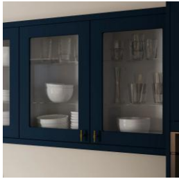
GoodHome Artemisia Matt midnight blue Glazed Cabinet door - £122