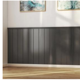
Cheshire Mouldings Tongue & Groove MDF Modern Wall panelling kit - £49