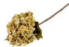
Green hydrangea Artificial foliage - £4