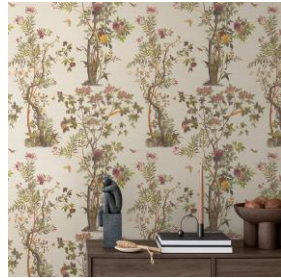
AS Creation Paradise Garden Cream Floral Wallpaper - £24.99 (€5 per m 2 )