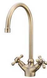
Torc Antique brass effect Kitchen Twin lever Tap - £55