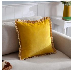
Wylder Solene Yellow Ruffle Velvet effect Indoor Cushion - £14