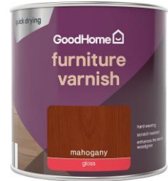
GoodHome Mahogany Gloss Multi-surface Furniture Wood varnish, 250ml - £7