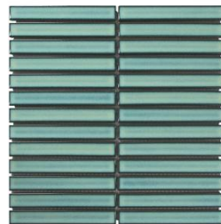
Orda Green Gloss Kitkat Ceramic Mosaic tile, (L)293mm (W)296mm - £12