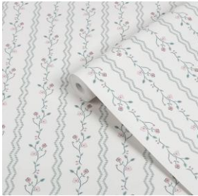
Laura Ashley White & Duck Egg Blencow Smooth Wallpaper - £29 (5.2m 2 )