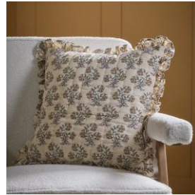
Multicoloured Floral Embroidered & printed effect Indoor Cushion - £15