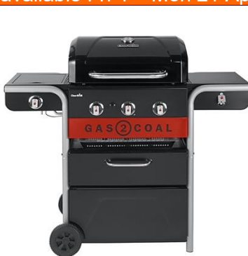
Char-Broil Gas2Coal 2.0 Black 3 burner Gas Hybrid BBQ Was £500, now £400 Save £50 (20%)