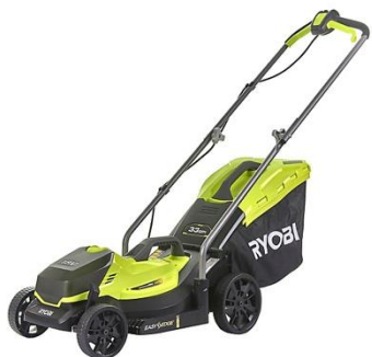
Ryobi ONE+ RLM18X33B50B Cordless 18V Rotary Lawnmower