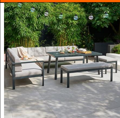
GoodHome Galini Black 10 Seater Garden furniture set Was £1,100, now £880 Save £220 (20%)