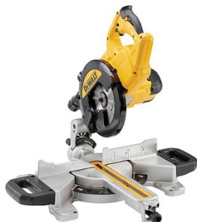
DeWalt 1300W 240V 216mm Corded Compound mitre saw DWS773-GB Was £230, now £190