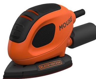
Black+Decker 55W 240V Corded Detail sander - BEW230-GB Was £22, now £18