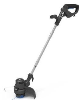
Mac Allister MGT35025 350W Corded Grass Trimmer