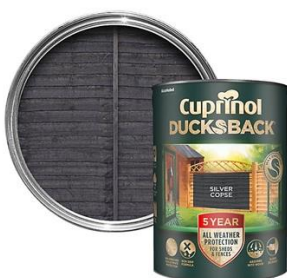
Cuprinol Ducksback Silver Copse Matt Exterior Fence & Shed Treatment Wood paint, 5L