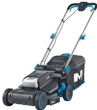
Mac Allister Solo MLM1835-Li Cordless 18V Rotary Lawnmower