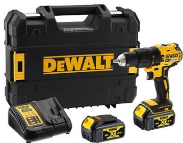
DeWalt 18V Li-ion Brushless Cordless Combi drill (2 x 4Ah) - DCD778M2T-GB Was £199, now £149